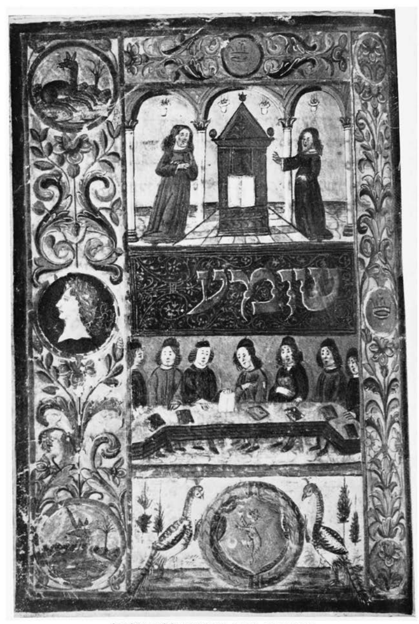
JEWISH SYNAGOGUE AND COLLEGE From an Italian Prayerbook written in Ferrara (?) in the latter half of the fifteenth century