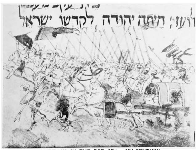
EGYPTIANS IN THE RED SEA. XV CENTURY From illuminated Italian Manuscripts in the Frankfort City Library