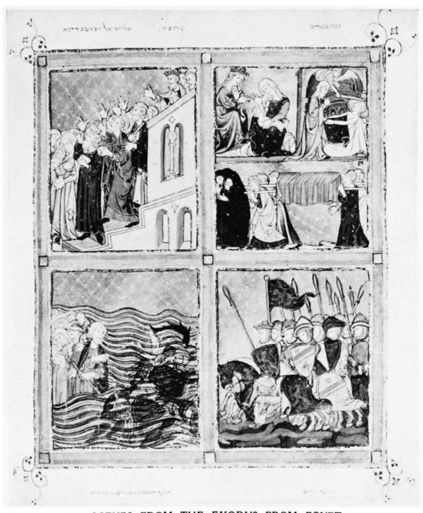
SCENES FROM THE EXODUS FROM EGYPT From an Italian Hagadah, XIV century [British Museum, Add. 27210]