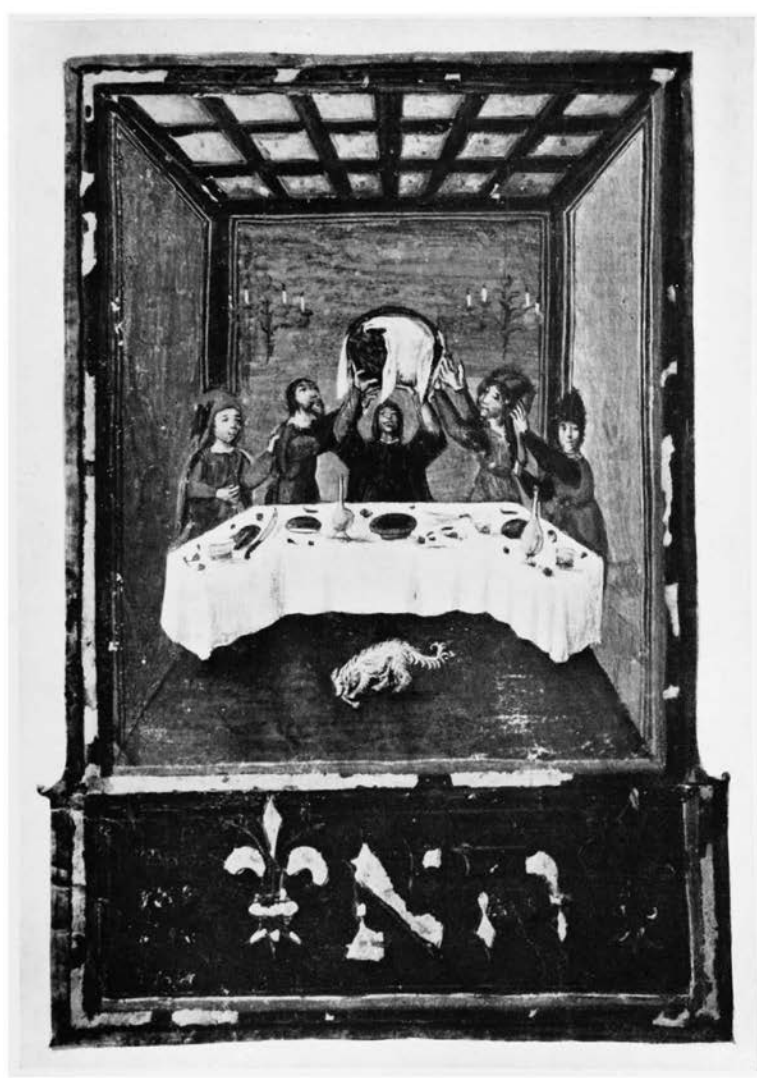
PASSOVER SUPPER From an Italian Prayerbook, late XV century [Me. Bicart-Sée's collection]