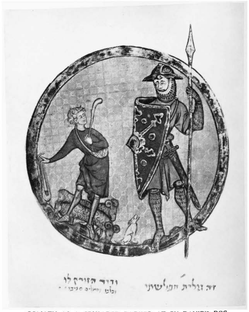
GOLIATH AS A CRUSADER BARKED AT BY DAVID'S DOG From a Manuscript Pentateuch and Prayer Book written in France and illustrated by Benjamin ha Cohen ca. 1278. (British Museum Add, 11639)